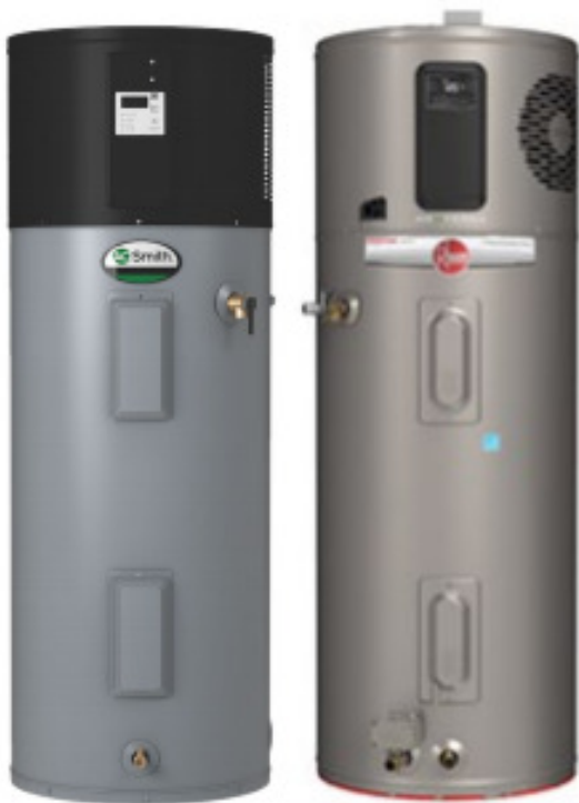
Hot Water Heaters