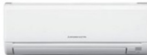
Heat Pump HVAC Mini-splits